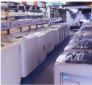
DOMESTIC ELECTRIC APPLIANCE