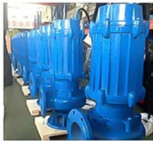
PUMPS & FLUIDS INDUSTRY