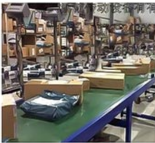
LOGISTICS AND TRANSPORTATION