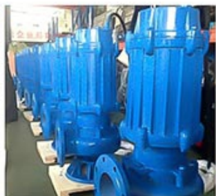
PUMPS & FLUIDS INDUSTRY