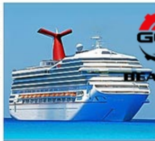
SHIP REPAIR INDUSTRY