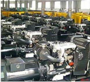
ELECTRIC MOTOR INDUSTRY