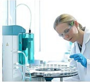
MEDICAL DEVICE INDUSTRY