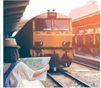
RAIL TRANSPORTATION INDUSTRY