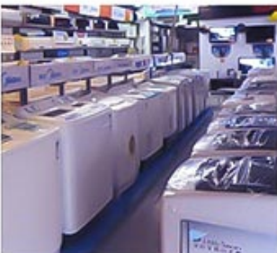
DOMESTIC ELECTRIC APPLIANCE